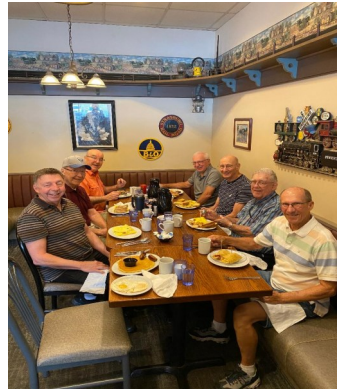
Making Breakfast Memorable