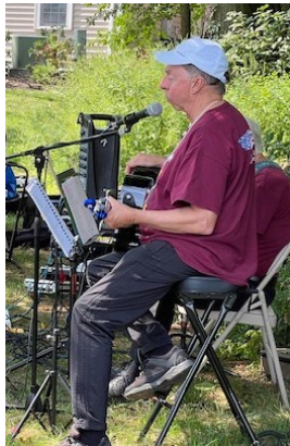
Picnic at Bucolic Waltz Vineyards.