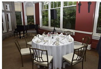
Hamilton Club Table setting