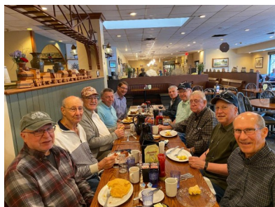
May 2025 Breakfast