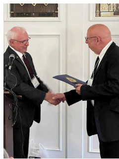
Meadia Heights Dinner Meeting April 17, 2025