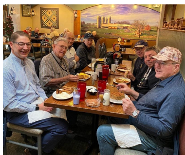
March 2025 Breakfast at "The Dairy"