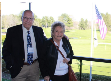
Enjoying Meadia Heights