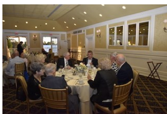
Dinner at Bent Creek