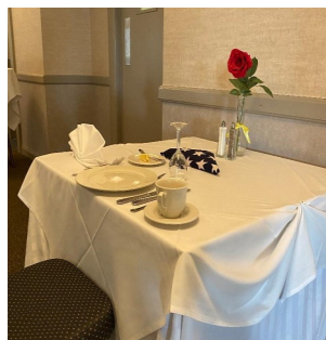
Waiting for a loved one.