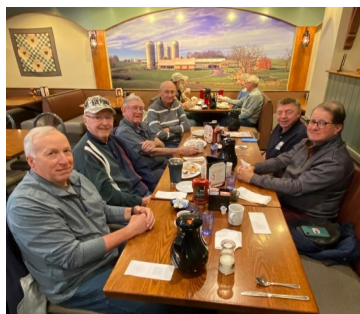
November breakfast gathering. Join us and be a regular!