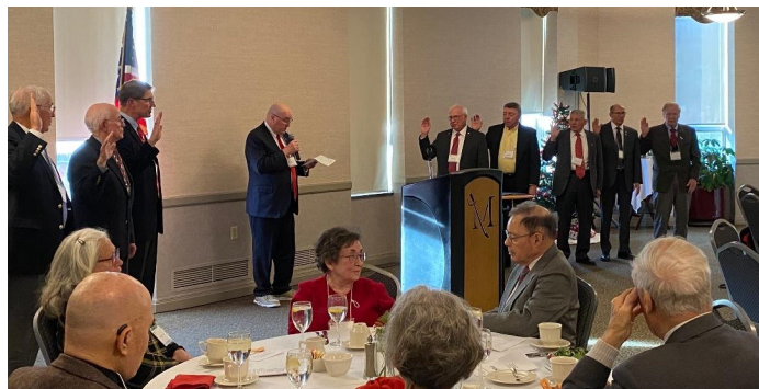
Installation of new Officers and Directors at Christmas luncheon.