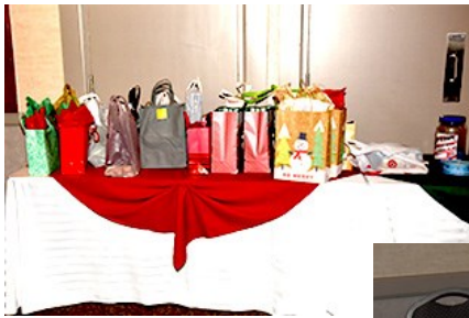
Our Veterans Gifts