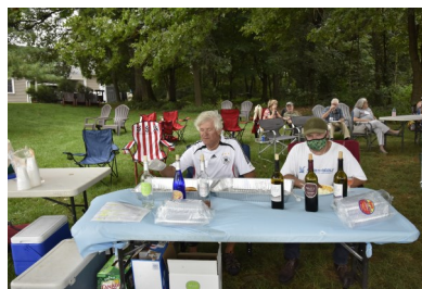
Waltz Wine Samples