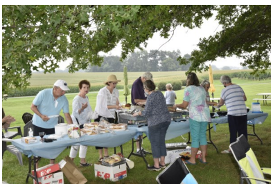
Food is served