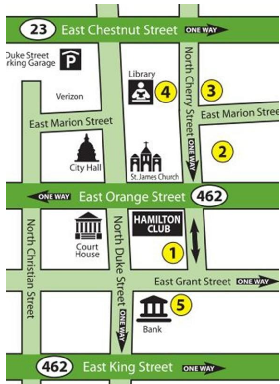
Hamilton Club in Lancaster City

Parking is available behind the Hamilton Club at the Murray Ins. Lot (#1 in map below), accessible from N. Cherry Street or E. Grant Street. Park in spots numbered 1 to 28 only. Metered street parking along Orange St and N. Duke St. is also available and is not charged after 6 PM. Another parking option is the Duke St Garage where you can enter from either E. Chestnut St. (Route 23) or N. Duke. Disregard parking sites 2,3,4 & 5 in the map below: