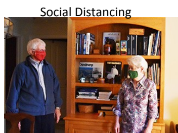
You're too close!