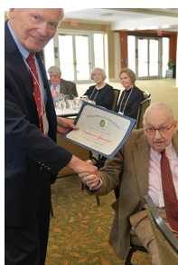
Geo Knapp Award