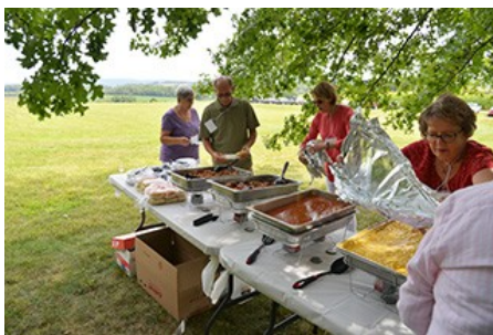
Food is served