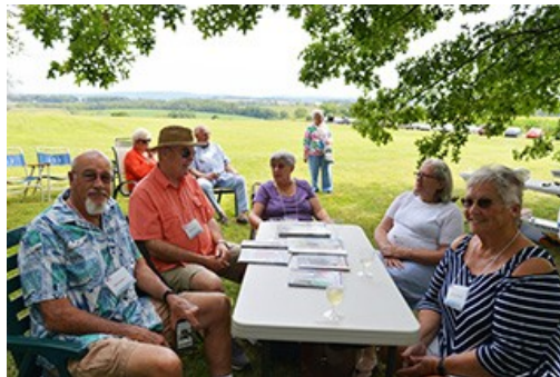
Enjoying the view