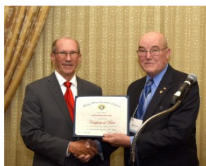
Job Well Done!