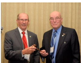
Passing the Gavel