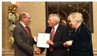
Benchhoff MOAA National Leadership Award